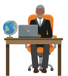
Finance & Insurance